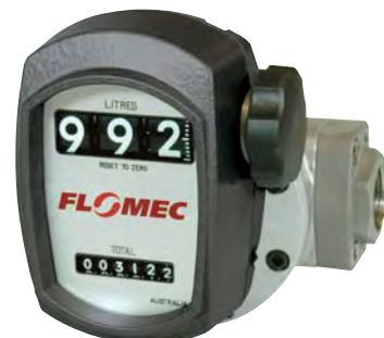
with 3 or 4 digit mechanical register