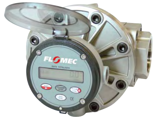
with LCD register